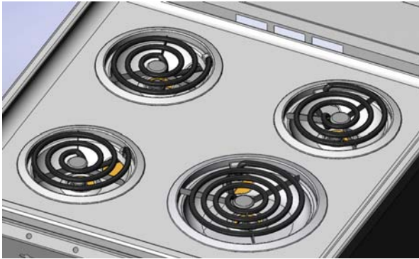
Normal view with coil elements inserted